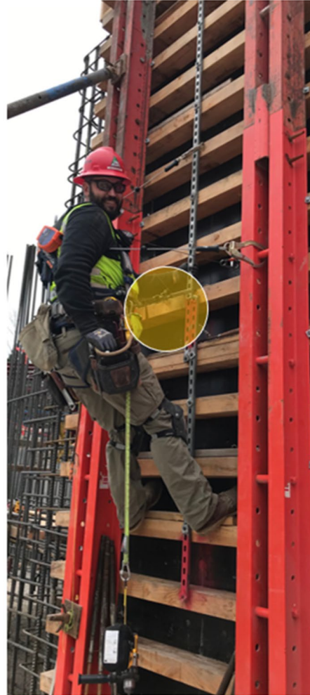
At work location engage P-hook to reduce fall distance to 2 feet