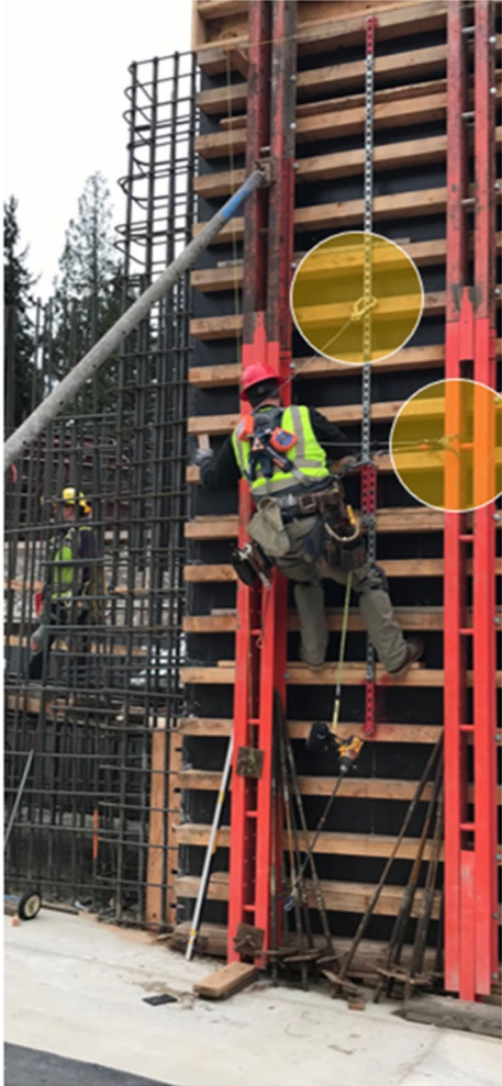
Utilize Nano-Lock while climbing/traversing